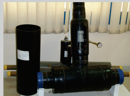
Ray Joint Coupling