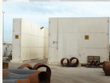
Non Destructive Test Bunker