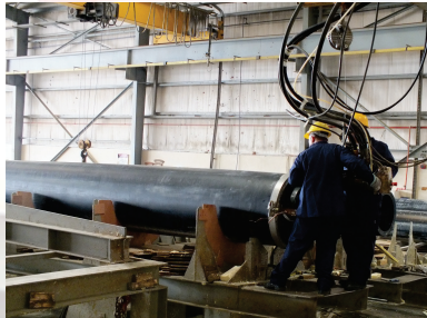
High Pressure Injection – PIP