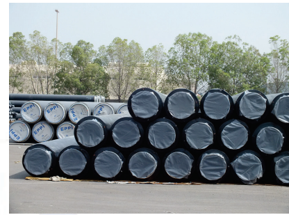
Preinsulated Pipes Storage