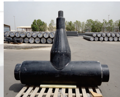
Preinsulated HDPE fitting