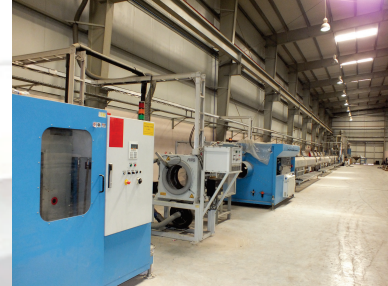
HDPE Extrusion Line - 400