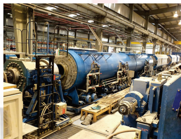
HDPE Extrusion Line -1200