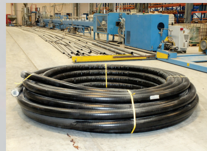
Preinsulated Flexible Pipe (100 M)