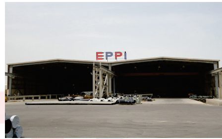
Large Production Facilities

EPPI was established in the year 2000 in response to the needs of the local market in having a reliable manufacturer for preinsulated pipes for the district cooling industry. Our manufacturing facility is located in the Industrial City of Abu Dhabi (ICAD-1) with two major factories occupying a combined plant area of 48000 square meters. Our storage areas are capable of stockpiling more than 50-km of pipes in mixed sizes, several thousands of fittings, hundreds of tons of raw material in both plastics and chemicals.