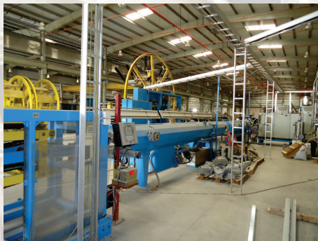
Flexible 3-IN-1 Preinsulated Pipe Production Line

The factories are equipped with two production lines for preinsulated pipes, a dedicated steel fabrication and welding workshop with NDT (Non Destructive Test) bunker; The dual blasting stations - manual and auto-blast with an airless - spray coating shed; plastic fabrication and fittings insulation stations; Two automated plastic extrusion lines; three-in-one automated flexible preinsulated pipe production line and field joint kits (ray joint) production line. EPPI offers complete steel pipe protection services prior to insulation, such as, shot/grit blasting on internal & external surfaces. Airless spray epoxy coating is applied as per the project's specification.