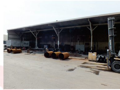
Steel Fabrication Workshop

EPPI has a team of highly trained fabricators, technicians and certified welders to handle all steel pipe fabrication processes including cutting, threading, grooving and welding according to international standards such as API and ASME. All welding processes will undergo non destructive testing along with the required in-house and third-party test programs.