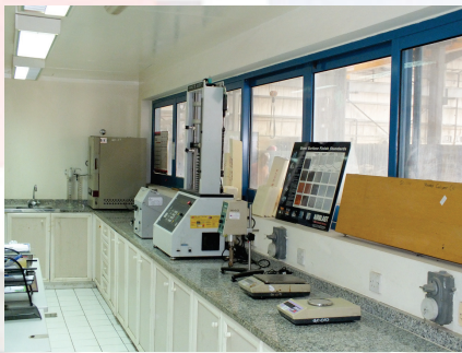
Quality Control Laboratory

EPPI provides quality products, piping system stress analysis capability, incorporation of leak detection and surveillance system, on-site technical assistance and installation supervision whenever needed. Our Quality Management system is an ISO 9001:2008 certified throughout the entire manufacturing processes. We have an approved EHS Management System (EHSMS) implemented to protect Environment, Health and Safety of all employees and the society in general.