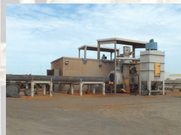
Auto Blasting Station

The factories are equipped with two production lines for preinsulated pipes, a dedicated steel fabrication and welding workshop with NDT (Non Destructive Test) bunker; The dual blasting stations - manual and auto-blast with an airless - spray coating shed; plastic fabrication and fittings insulation stations; Two automated plastic extrusion lines; three-in-one automated flexible preinsulated pipe production line and field joint kits (ray joint) production line. EPPI offers complete steel pipe protection services prior to insulation, such as, shot/grit blasting on internal & external surfaces. Airless spray epoxy coating is applied as per the project's specification.